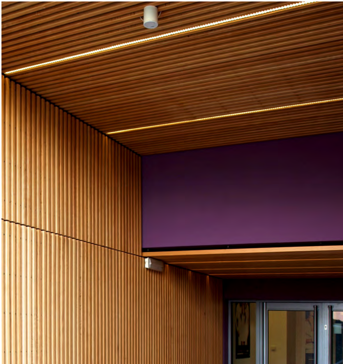
GRILL™ TYPE 7/ 3050/ 33 DOWEL, WALL & CEILING PANELS, AMERICAN RED OAK