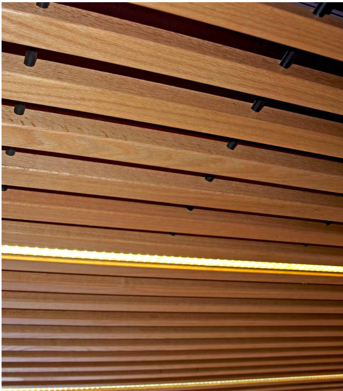
GRILL™ TYPE 7/ 3050/ 33 DOWEL, WALL & CEILING PANELS, AMERICAN RED OAK