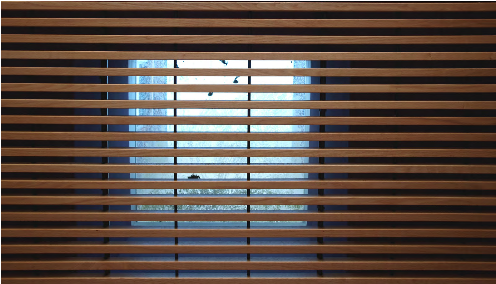
GRILL™ TYPE 7/ 3050/ 33 DOWEL, WALL & CEILING PANELS, AMERICAN RED OAK