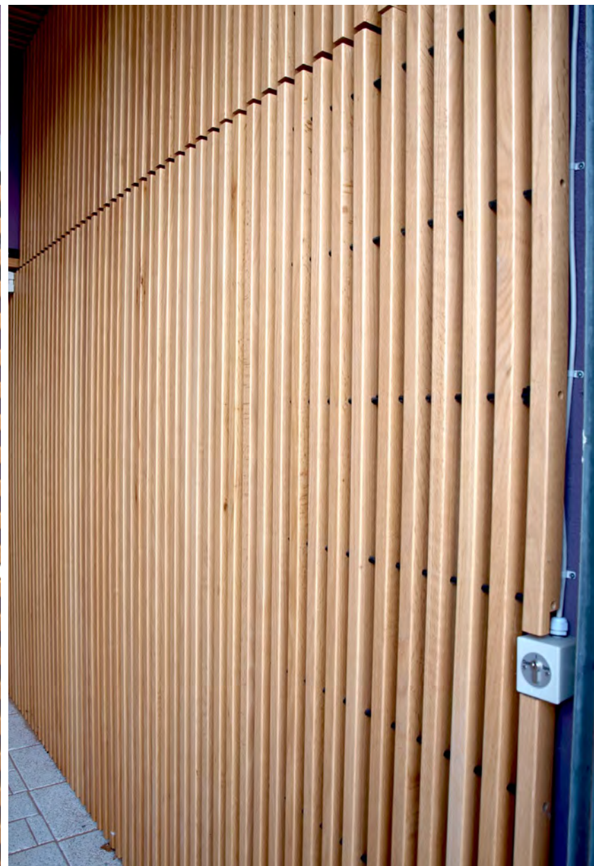
GRILL™ TYPE 7/ 3050/ 33 DOWEL, WALL & CEILING PANELS, AMERICAN RED OAK