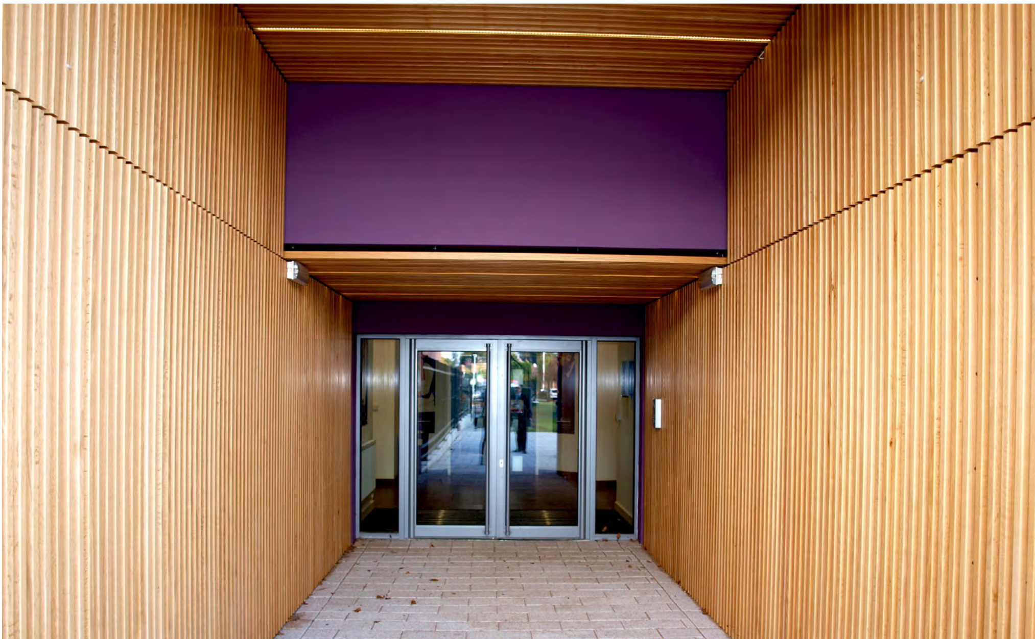
GRILL™ TYPE 7/ 3050/ 33 DOWEL, WALL & CEILING PANELS, AMERICAN RED OAK