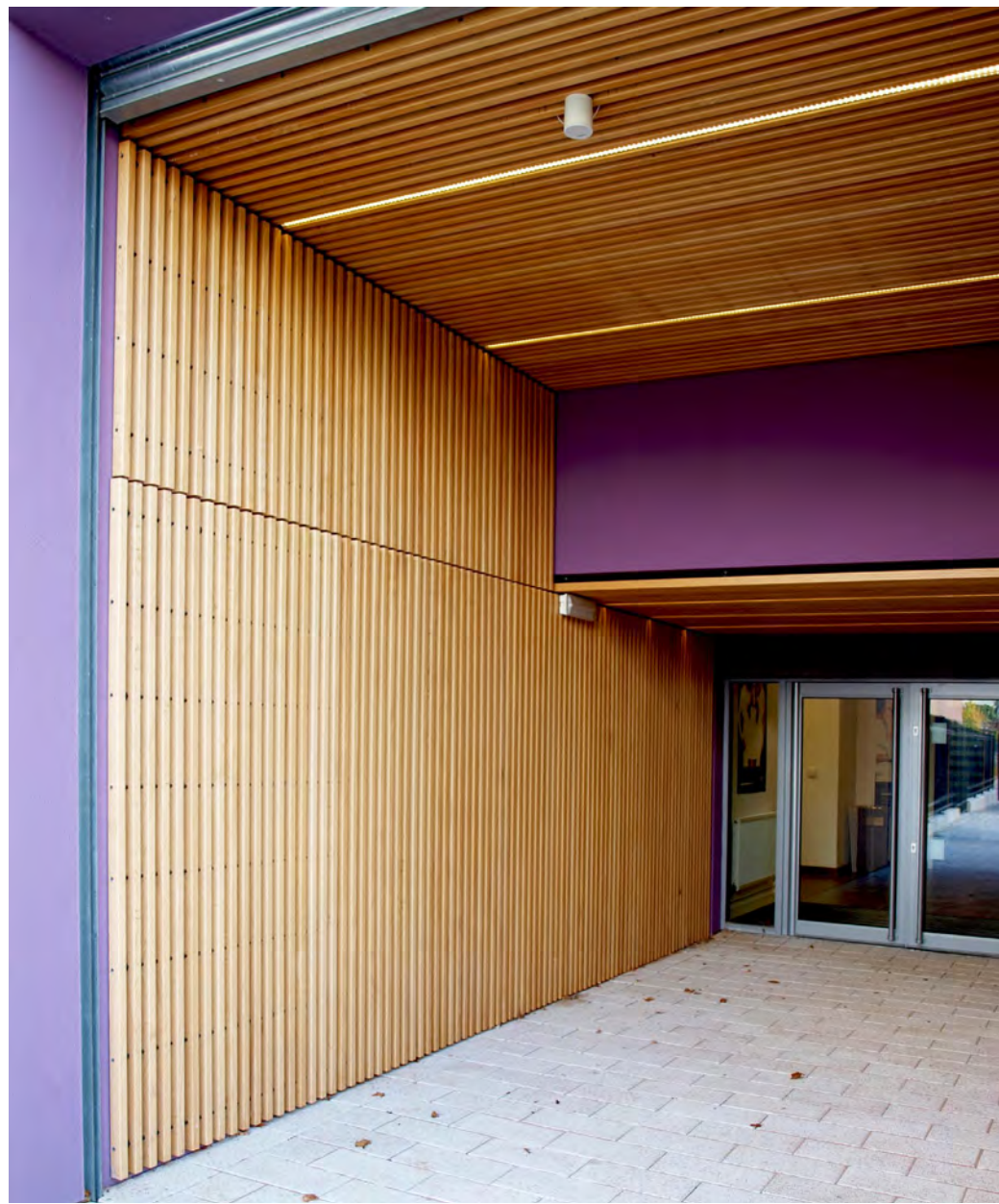
GRILL™ TYPE 7/ 3050/ 33 DOWEL, WALL & CEILING PANELS, AMERICAN RED OAK